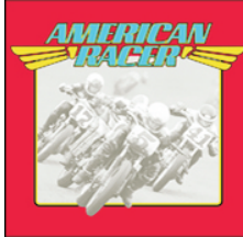
American Racer 1940-1980