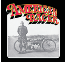
American Racer 1900-1940